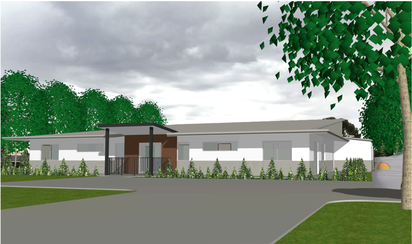
VIEW OF PROPOSED BUILDING FROM SOUTHEAST