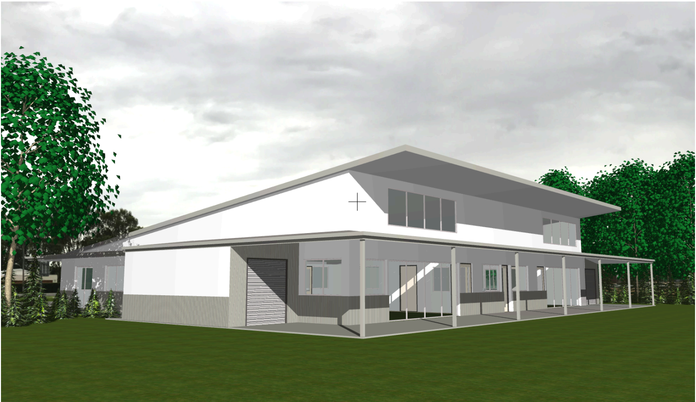
VIEW OF PROPOSED BUILDING FROM NORTHEAST