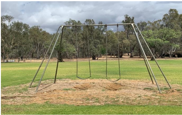
Figure 6 - Existing older style swings