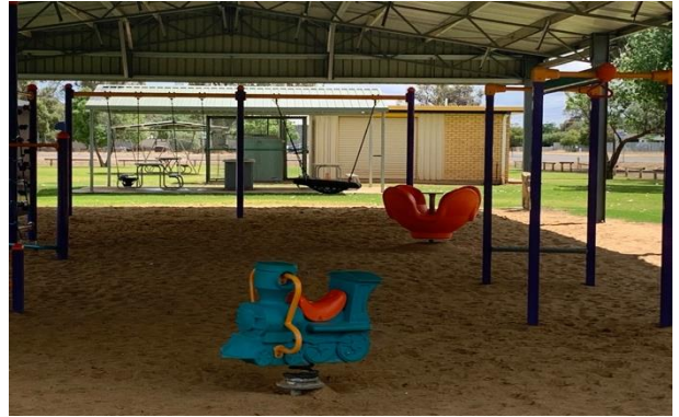
Figure 11 – Existing play equipment