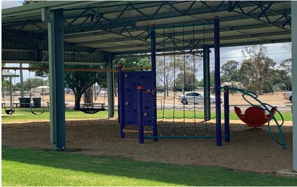
Figure 10 – Existing climbing equipment