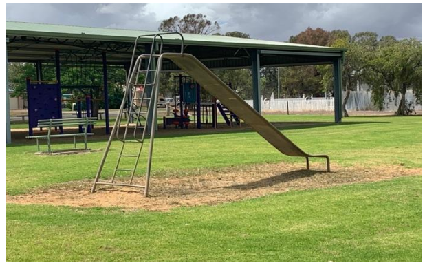
Figure 7 – Existing older style slippery dip