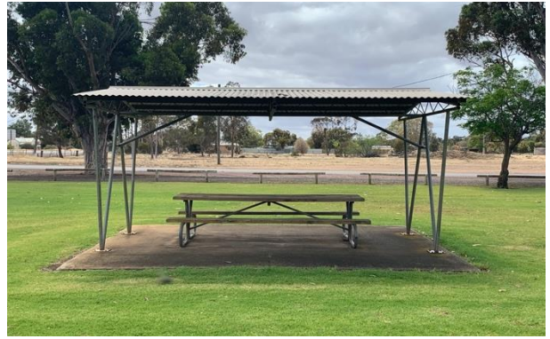
Figure 5 – Picnic table and shelter