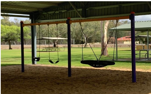
Figure 8 – Existing newer style swings