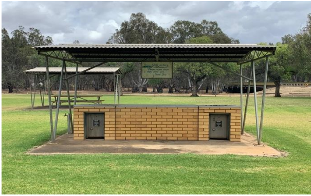
Figure 4 – BBQ facilities