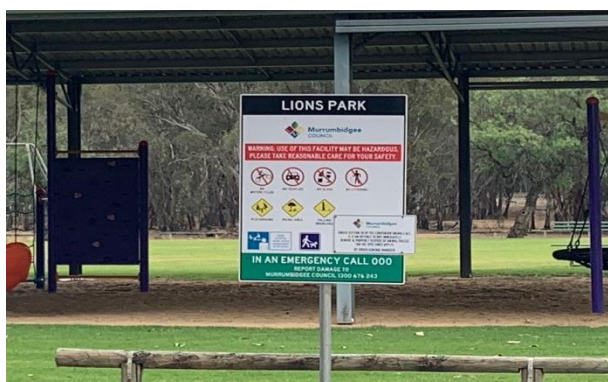
Figure 2 - Signage 4