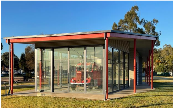
Figure 12 – Display & amenities building