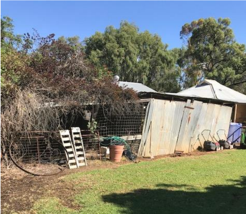
Shed to be demolished