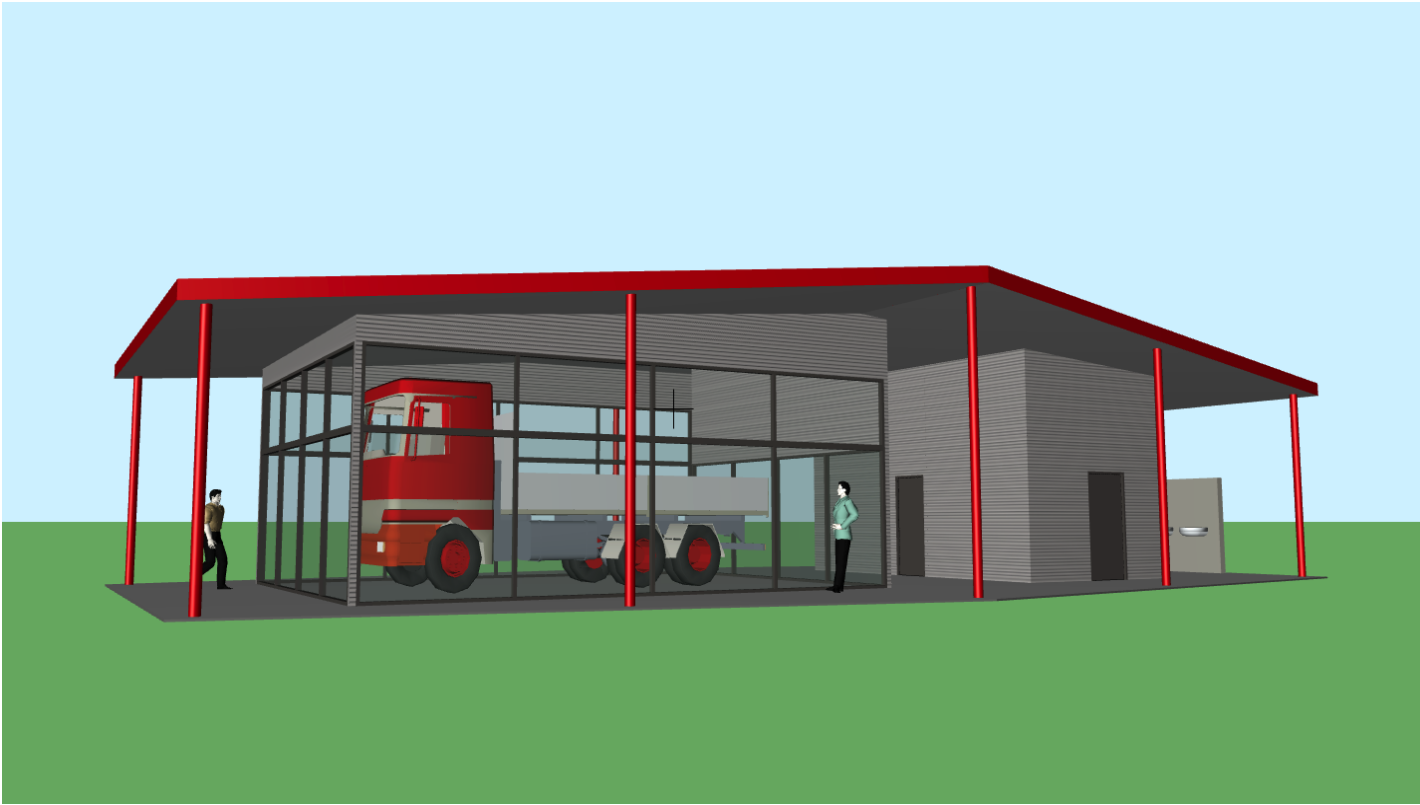
VIEW FROM FRONT NORTH CORNER