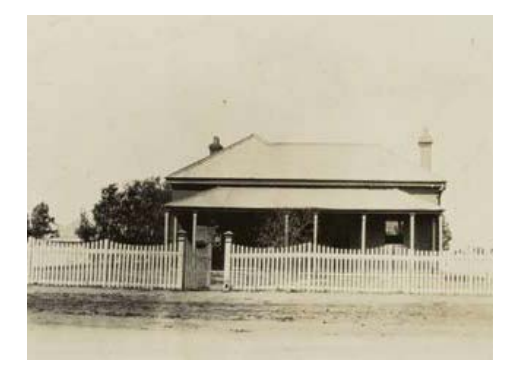
Photograph of the Courthouse taken in 1911 – 1929.

Plan of Court House façade with proposed 1889 extensions. The dotted line depicts the extent of the original building.