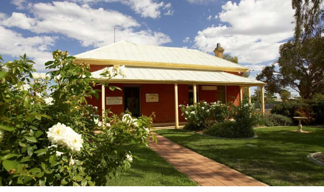
Jerilderie Court House was converted to the town's public library after its closure as a Courthouse on 1 August 1988.

When originally built the Court House was a rectangular brick building with a hipped roof of corrugated iron. In 1889 the building was extended to the west (or to the right looking from the main street) to provide a witness' room. In the 1920's further extensions were made to include a porch off the