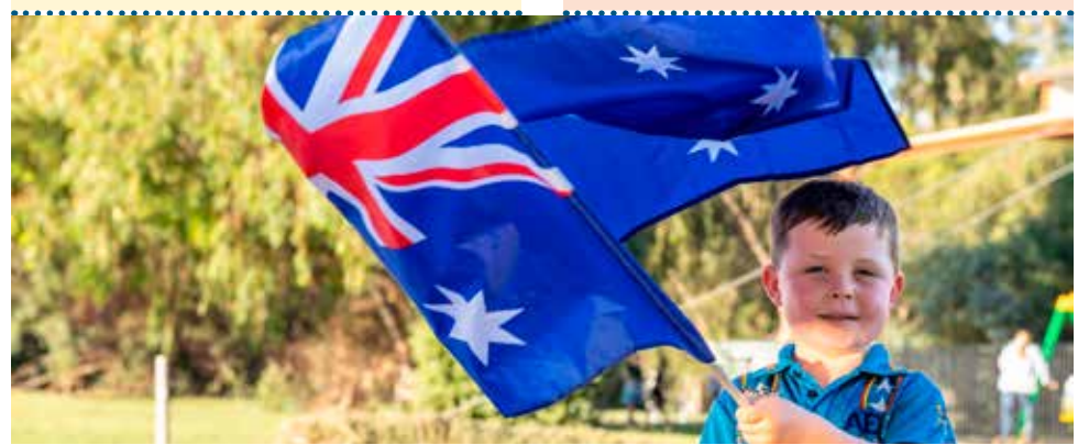
We have some fabulous images from the 2023 Australia Day activities, made possible with funding from the National Australia Day Council.

The recent Portsea Camp was a roaring success with 26 young people from our area having an absolute ball for 5 days in January. We participate in the Portsea Camp every year, so stay tuned if you'd like to go next year. It's a great summer holiday activity!