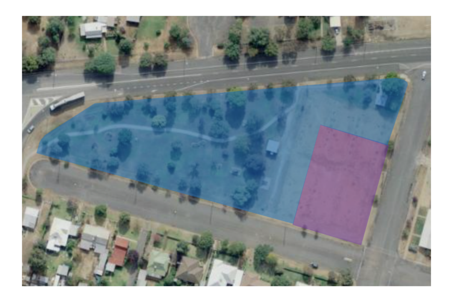
Figure 1 – Local Government Act categorisations within Elliott Park