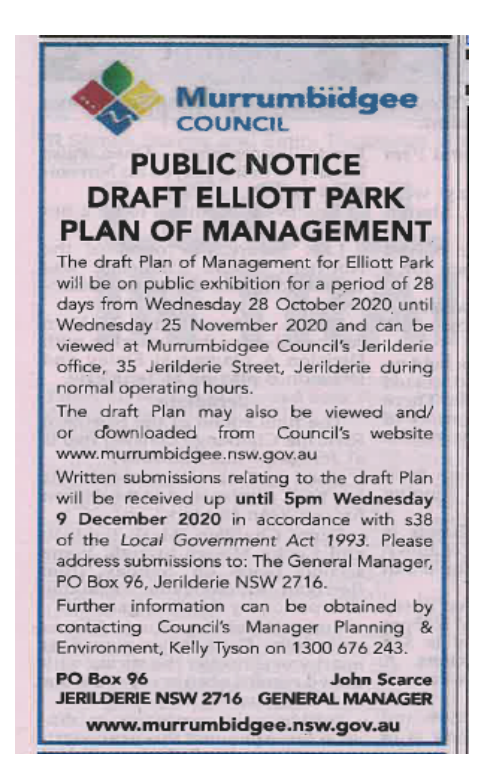
Figure A – Public appearing in Southern Riverina News on 28 October & 18 November 2020