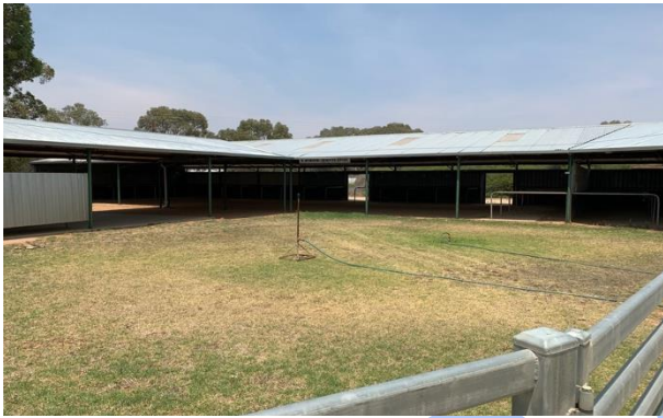
Figure 8 – Stables and pen