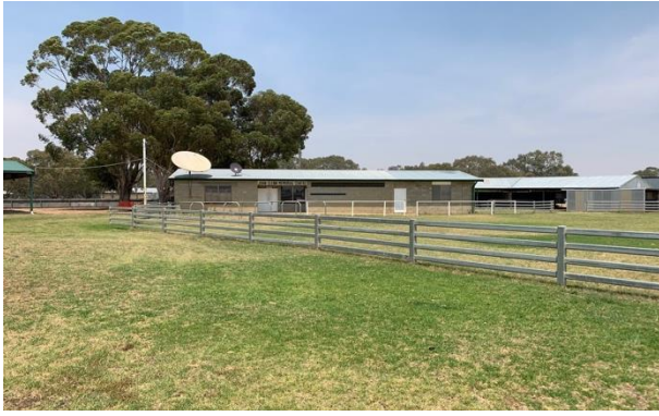
Figure 6 – Stewards building