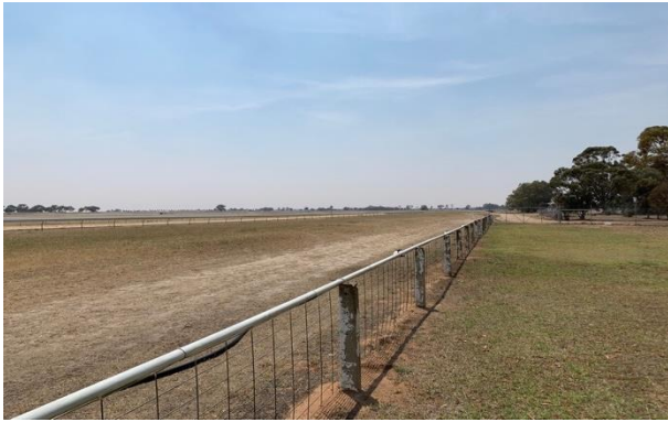
Figure 12 – Home straight of race track