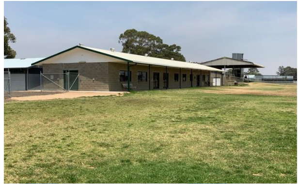
Figure 3 – Clubhouse and bar area