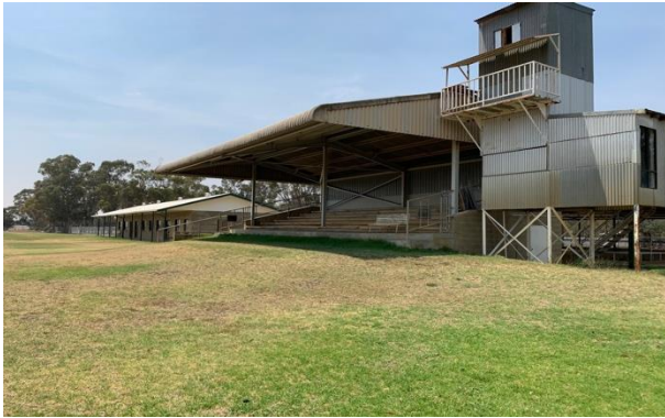
Figure 2 – Grandstand and control tower 5