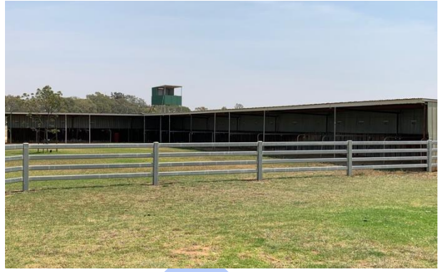
Figure 7 – Marshalling area and stables