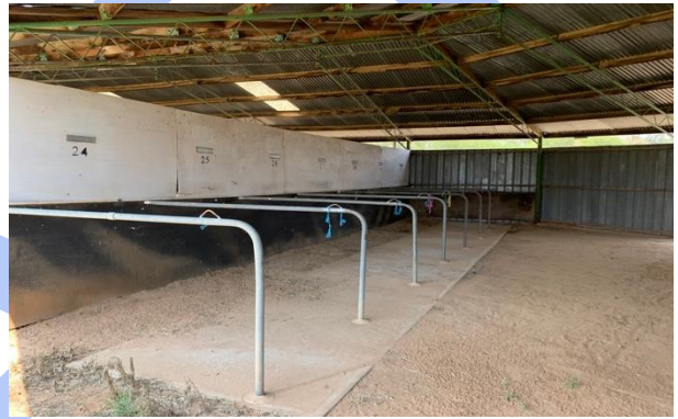
Figure 9 – Stalls in stable