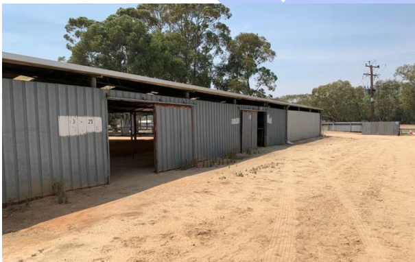
Figure 10 – Sheds