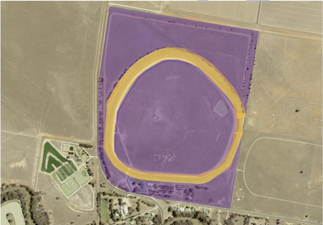
Figure 2: Land categorisation