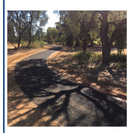
The new Coleambally walking track spans 1.2km.

Consultants have been engaged to produce a concept plan for the Brolga Place upgrade and Sportsground Masterplan, watch this space!