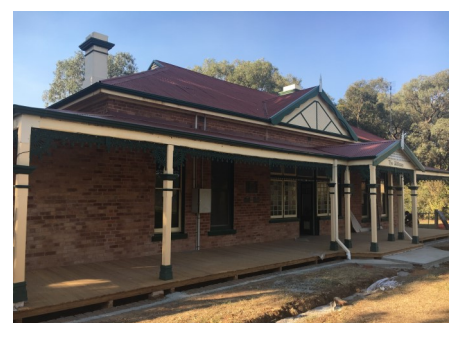
The Willows repairs were funded by a Heritage Near Me Grant from State Government, owners of the building.

Works are almost complete at The Willows with the brickwork and verandah works completed last month and paving and painting works scheduled to finish early May.