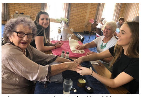
& Pretty Nails Workshop