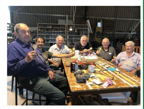
Wood Carving Workshop at the Coleambally Men's Shed