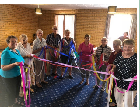
Wellbeing for All Workshop