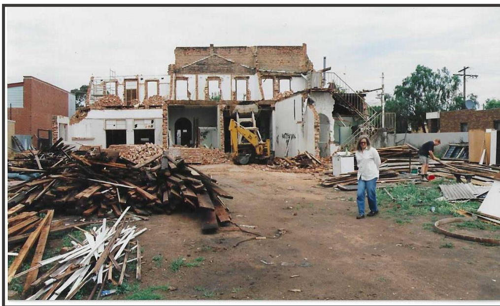
Photograph taken in 1999 from the rear of the Riverina Hotel, with demolition underway.

The Hotel licence was eventually sold and transferred to Sydney in preparation for the 2000 Sydney Olympic Games, with the Hotel being demolished.