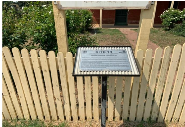
Figure 3B – History trail plaque