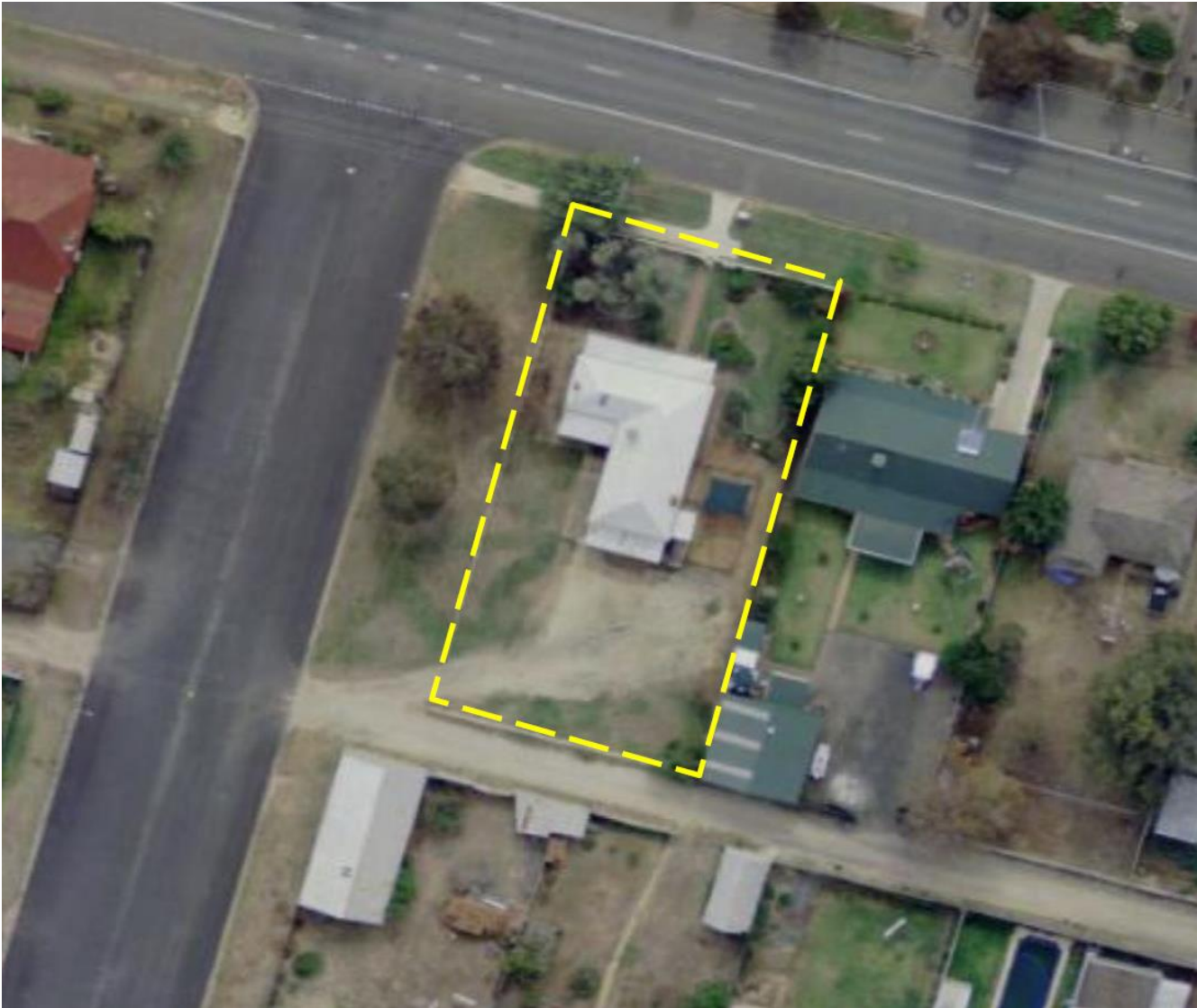
Figure 1 – Aerial Image of Jerilderie Courthouse & Library

Land not covered by this plan includes community land covered by other plans of management listed in Table 2.