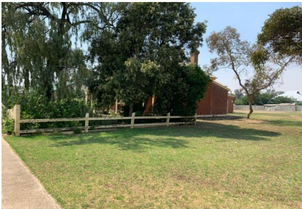
Figure 3C – Lawns and gardens