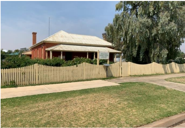
Figure 3A – Existing building 4