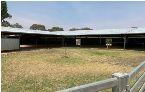
Figure 8 – Stables and pen