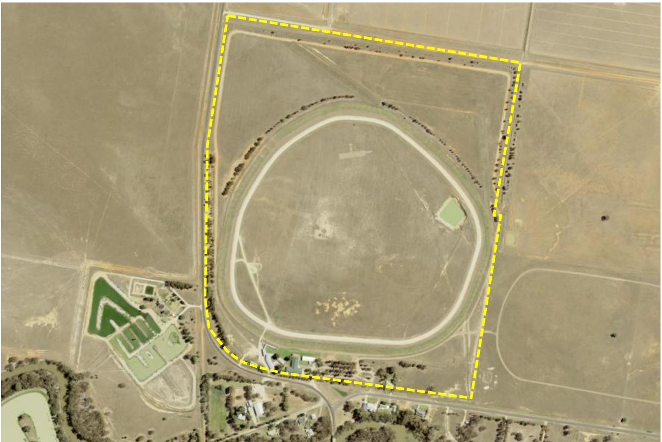
Figure 1: Jerilderie racecourse and showground 1

The Plan of Management for the Jerilderie Racecourse and Showground (JRSPoM) was adopted on 23 May 2023 (minute 79/05/23) .