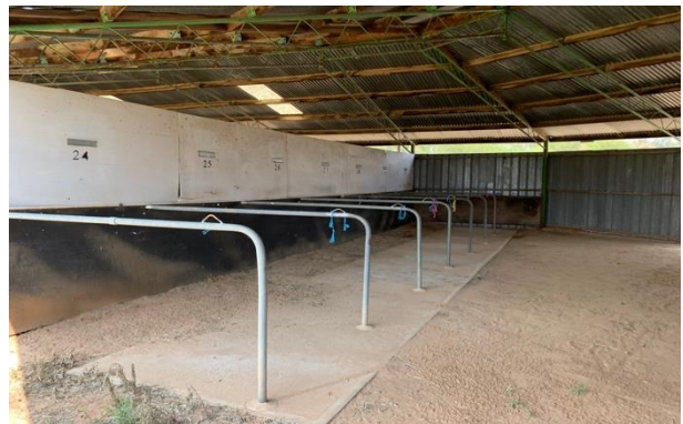
Figure 9 – Stalls in stable