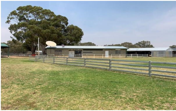
Figure 6 – Stewards building